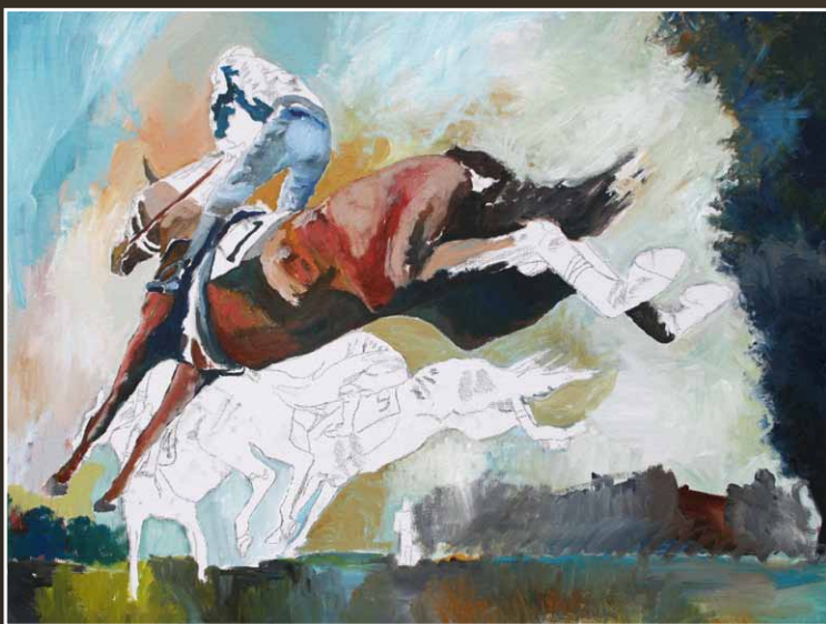
Flight : A work in progress