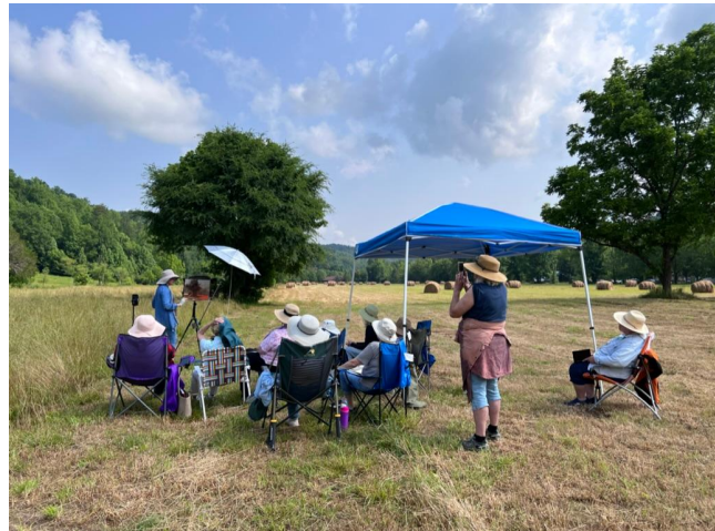
Painting a demo in an obliging field.

Then, we meet for a gathering before dinner to discuss all sorts of aspects of