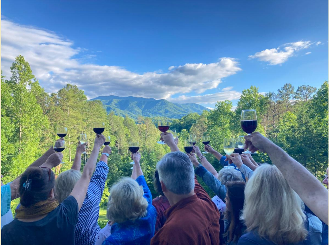
Standing on the porch of our Inn, we toasted the Smoky Mountains one night after dinner.