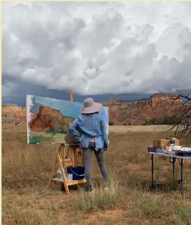
Rachael Painting Plein at Air Ghost Ranch, NM © 2023

One day a friend asked me, "Do you realize we might only have twenty summers left?" I bolted upright. What?