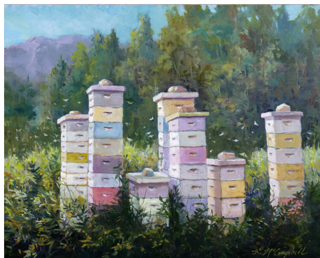
"Smoky Mountain Beehives," plein air painting by Rachael McCampbell, juried into the NOAPS Best of America Small Works Exhibit 2022 ©