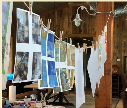
Cold wax works on paper