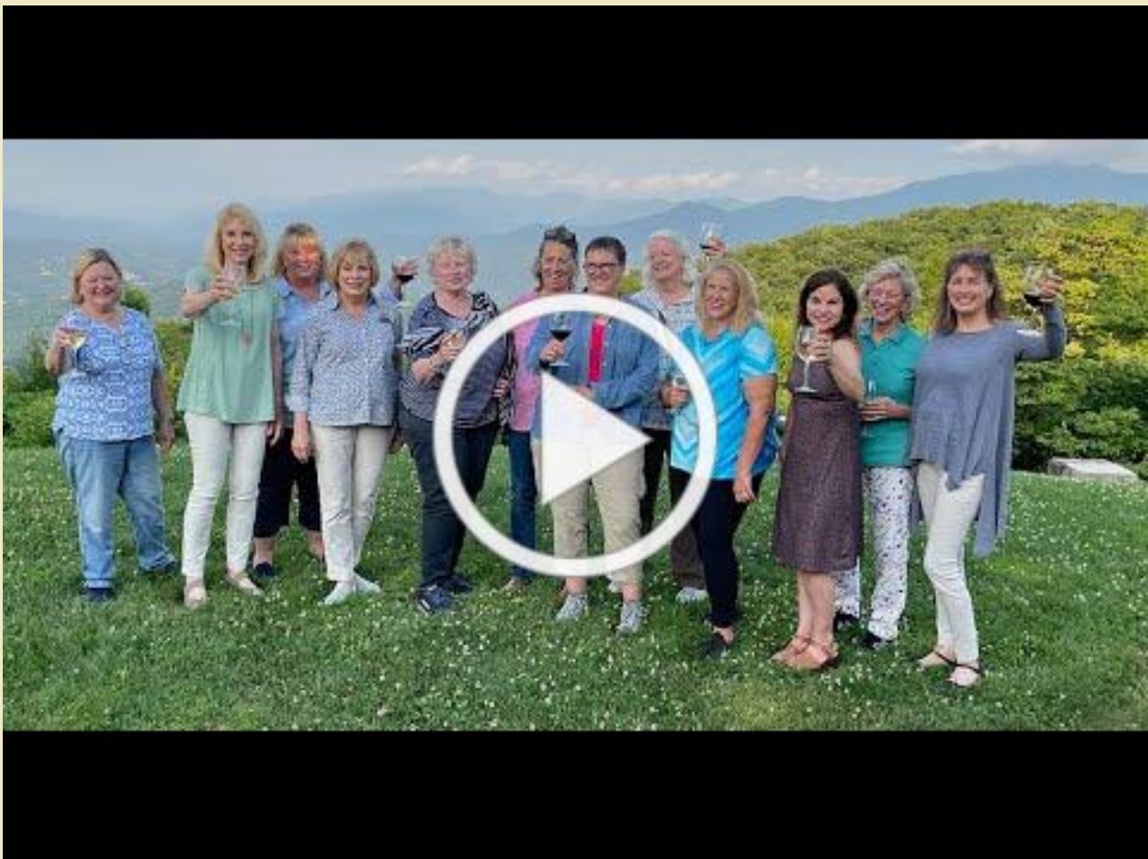
Watch this video to see where we stay, paint and get the feeling of how fabulous this trip is!